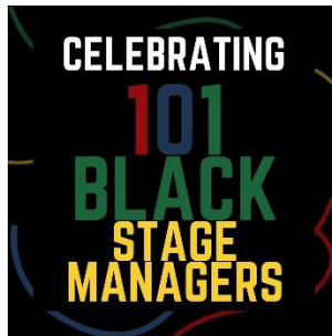
101 Black Stage Managers Celebration Logo – Special Recognition